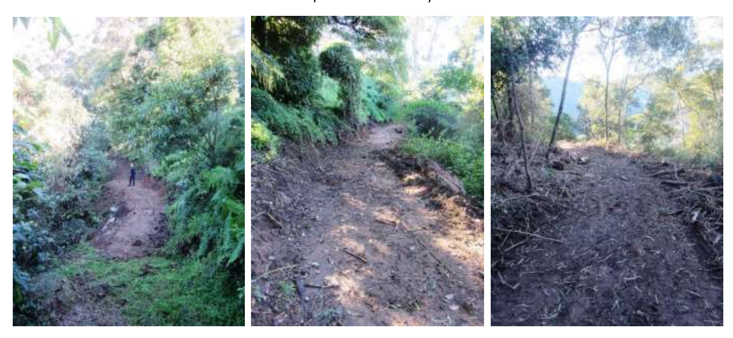
Contour track below the home providing access for spraying lantana.