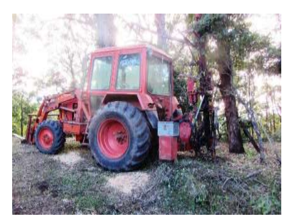
25<sup>th</sup> July 2013 – John Kubale – <u>www.shoalhavenlandcare.org.au</u>

A tractor with a post driver owned & used by one of the landholders to construct the fencing required to prevent cattle from crossing property lines after lantana removal. Landcare provided some of the fencing material whilst labour was provided by the landholders.