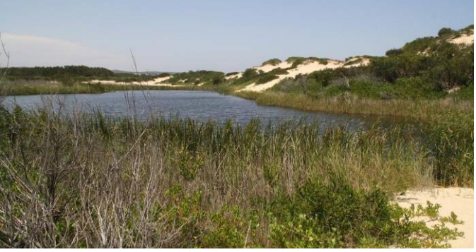
Third Creek area within the Belmont Wetlands State Park