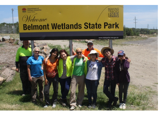
Above: International and local volunteers at BWSP

The Belmont Wetlands State Park Trust currently strives to gain funding and support to continue relevant land and