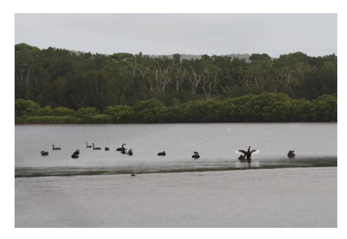
Above: View to the Melaleuca Forest N. of Belmont Lagoon-a long-term Landcare area

The Landcare group with assistance from the community will continue the process of recovering forests, wetlands and dunes in nine different project sites over the next 12 months. Together with the Trust they will complete improvements to the fire trail system and commence more effective management of access