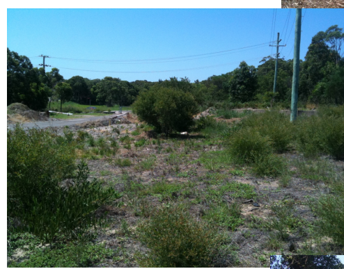
Left: Looking from the Power Easement to the Entrance of Kalaroo Rd, Belmont North (January 2010)

Right: Kallaroo Road entrance project site planting. (April 2010)