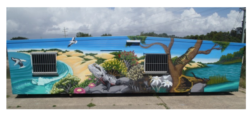
Above: Site Office Mural by A .Fussell showing the diversity of the Landcare site