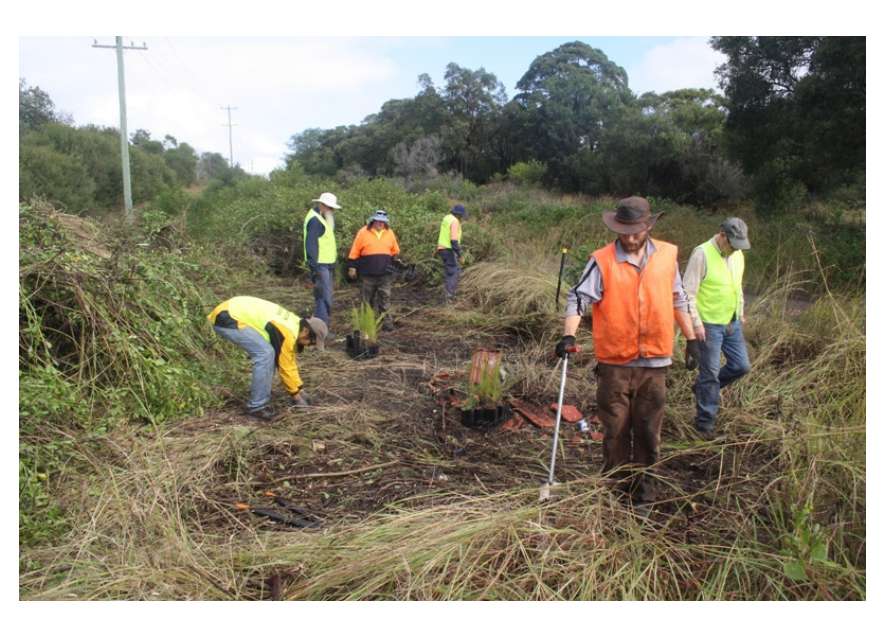
Above: Conservation Volunteers working on the Mobile Muster project site