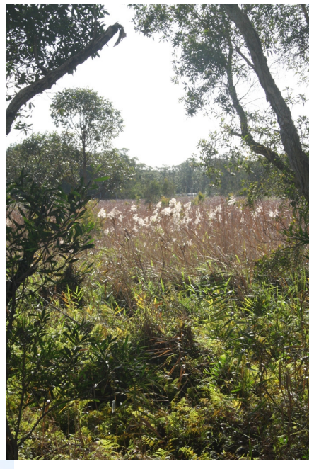
Above: Jewells Wetland from the track looking across to Fernleigh Track

The Park comprises seven recognised coastal wetlands and features the largest single open water wetland in Lake Macquarie, the Belmont Lagoon complex, that