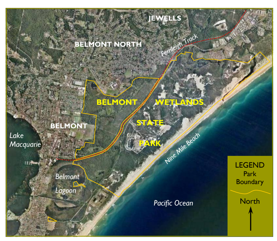
Above: Belmont Wetlands Site locality map