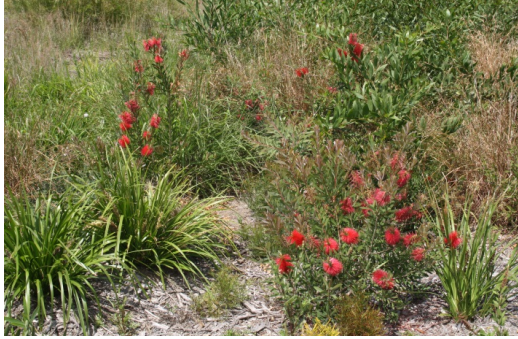
Left: Regenerating Entrance area (2013)