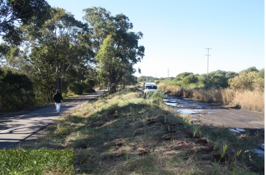
Right: After works (Sept 2012)