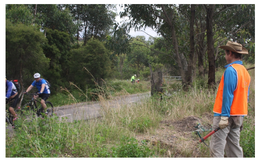
Above: Fernleigh Track is popular with cyclists and walkers and its surrounds are a focus for bush regeneration

conservation management, education, recreational and ecotourism activities within the Park.