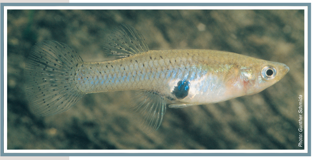
Eastern gambusia female