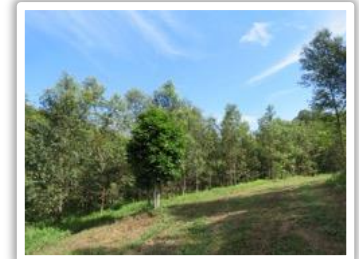
Koala food tree corridor