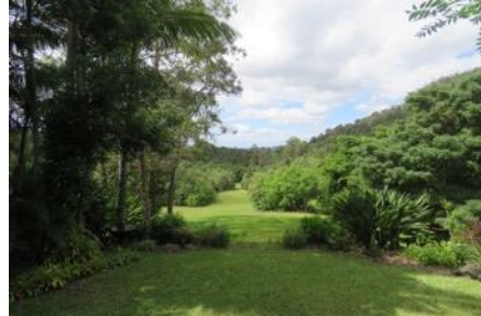
View from the verandah