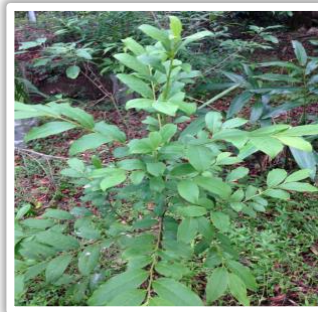
Rare Red Fruited Ebony (Diospyros mabacea)