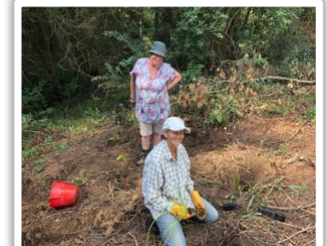
Hard at work