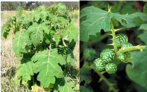
Tropical Soda Apple Fruit