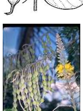
Family: Fabacae Shrub or small tree to 5 m