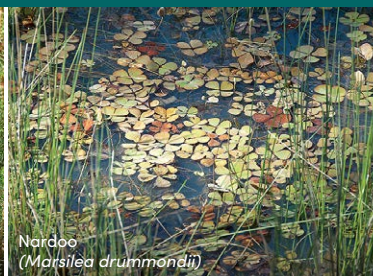
Nardoo ( Marsilea drummondii )