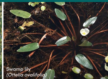
Swamp lily ( Ottelia ovalifolia )