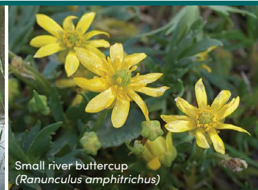
Small river buttercup ( Ranunculus amphitrichus )