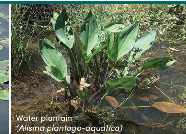
Water plantain ( Alisma plantago-aquatica )