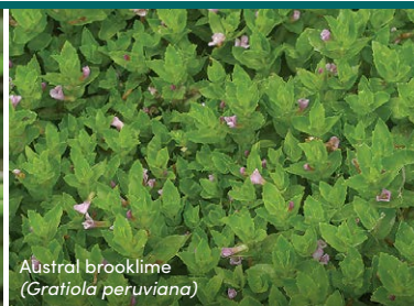
Austral brooklime ( Gratiola peruviana )