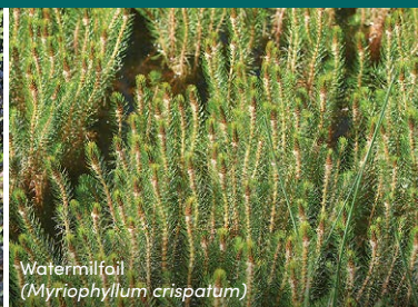
Watermilfoil ( Myriophyllum crispatum )