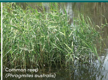
Common reed ( Phragmites australis )