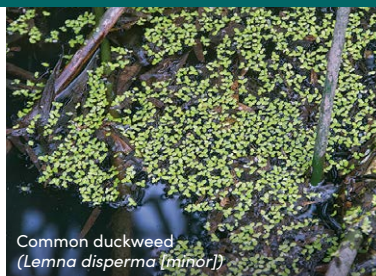
Common duckweed ( Lemna disperma minor )

Aquatic plants grow fully submerged in water. All are commonly found in riparian areas. In dry conditions, some can persist as semi-aquatic plants.