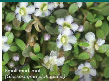
Small mud-mat ( Glossostigma elatinooides )

These plants can grow submerged or partly submerged in water.