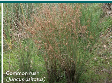
Common rush ( Juncus usitatus )