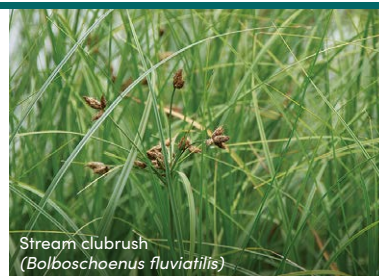
Stream clubrush ( Bolboschoenus fluviatilis )

These plants grow in water and in damp soil at the margins of water, but can cope with drying out. All are naturally found in riparian and drainage areas.