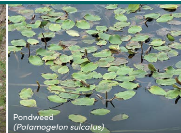
Pondweed ( Potamogeton sulcatus )