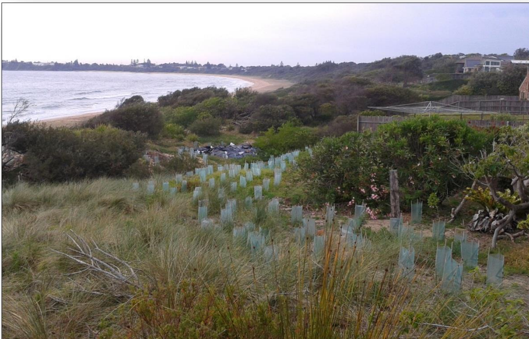
Site 4. The Mall