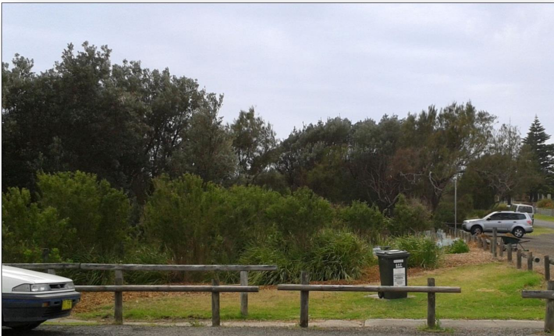
Site 2. Ocean Street