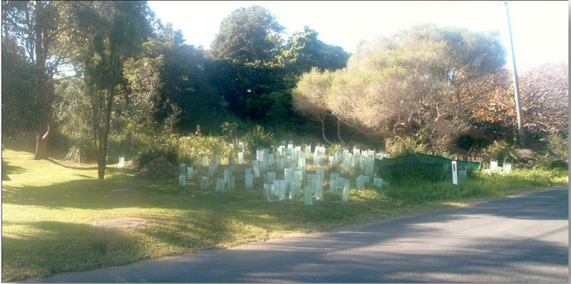
Site 3. Lee Street