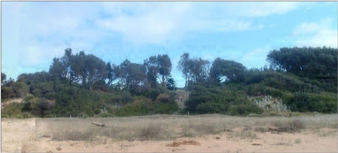
Site 1. The Marina (southern end)