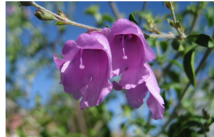
Purple Mint Bush Prostanthera ovalifolia - Grenfell form Unique to our region

We specialise in propagating plants of the Weddin Shire.