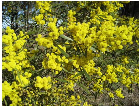
Hakea Wattle Acacia hakeoides

Shrubs – wattles, hopbush, indigofera, cassias, nodding blue lily and tea trees.