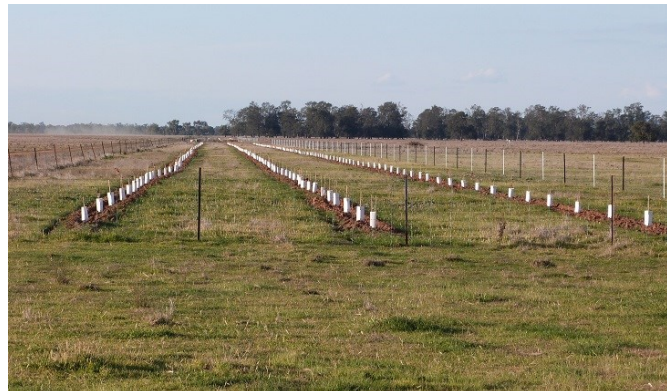
WCNN supplied native trees planted on "Caragabal West"

Groundcovers – Tall sedge, spiny rush, native violet, amulla and hardenbergia.