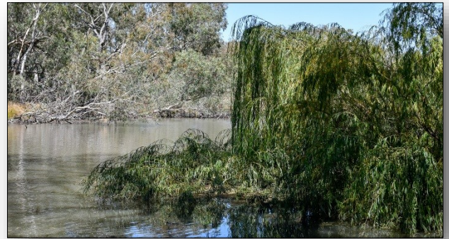
Willows on Colombo Creek, 2021.

Removal of willow at one site, a flyer, field day and workshop will be delivered in 2021-2022.