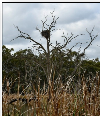
CSU monitoring project and White-bellied sea eagle nest, August 2021