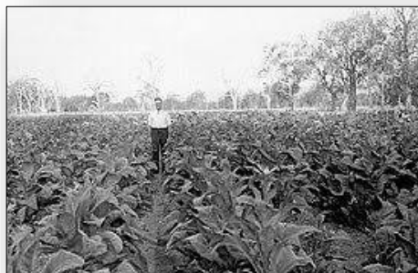
Tobacco plantation.