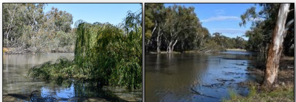
Colombo Creek - Willows 2021 before and after - June 2022. What a difference!

If you are interested in willow removal on your patch of the Yanco Creek System send an expression of interest to Andrea.