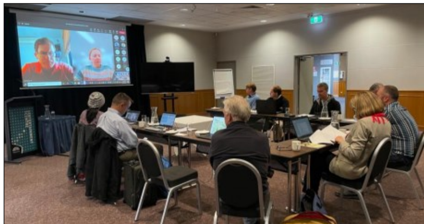
Blended meetings are being held on a regular basis. Albury meeting shown.

Since then the Better Bidgee program has been formed with suite of suggestions, including works on the existing Yanco Weir in the Murrumbidgee River. A presentation was made last month which provided a clear update on where this idea concept is at - ground zero! There are people working on modelling and a skeleton staff, however the state government is waiting for the federal government to release funding before any business case can be developed. Essentially the idea concept is at pre 2015 stage. Nothing to see here. Obviously, if things change we will keep you updated.