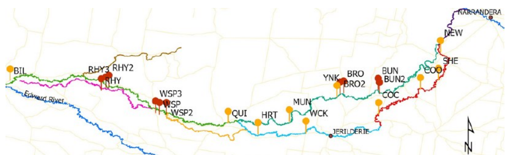
Wetland and creek monitoring sites - 2021-22

A nine page report was presented at the last EWAG meeting listing all the findings of the past year. It showcases our creeks and many wetland areas in addition to the proactive farming community that encourages monitoring to take place on mostly private property. The full report will be emailed to all members.