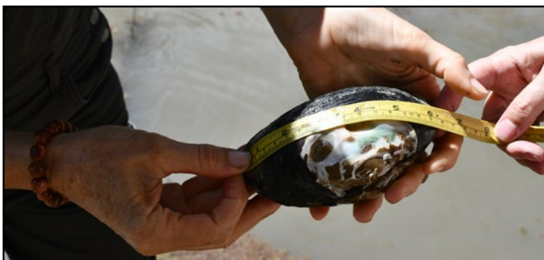
Photo: Collecting data on the Billabong Creek's freshwater river mussels.

It was fantastic to see the community so engaged, with over 10 people getting into the creek fully clothed in their enthusiasm to find mussels! Supported by Refreshing Rivers, the Mussel Muster is expected to be the first of many environmental initiatives at The Cape. The success of this open community event underscores the potential for future projects aimed at enhancing local knowledge and the health of the Central Billabong.