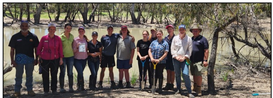
Photo: Last planting event for 2024 with Finley HS, Billabong Creek Jerilderie