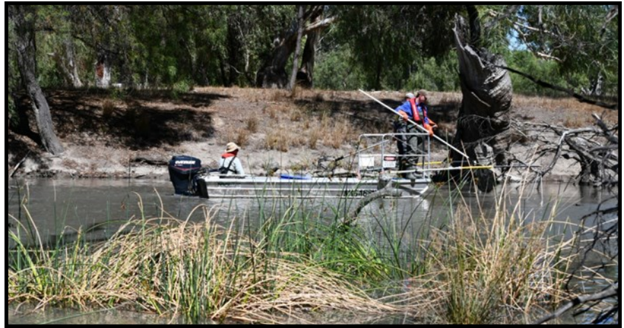
Photo: Electrofishing with the planted (2023) tall spike rush in the foreground.

Further updates on carp removal will be shared following three more electrofishing events planned for March, April and May 2025.