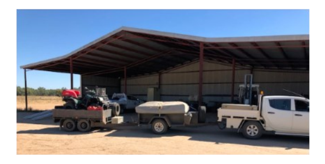
Road train for creek inspections