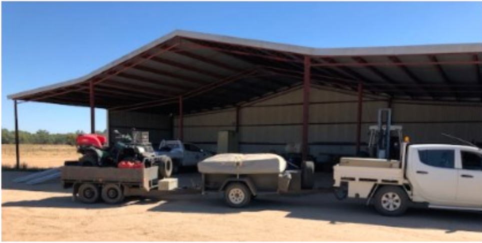
Road train for creek inspections