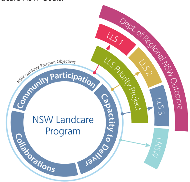
Fig 5. NSW Landcare Program Outcomes alignment to NSW Government and Landcare NSW Inc. goals, objectives and priorities.

Figure 5 below shows how the NSW Landcare Program aligns with NSW State Government objectives and outcomes as well as Local Land Services Goals and Landcare NSW Goals.