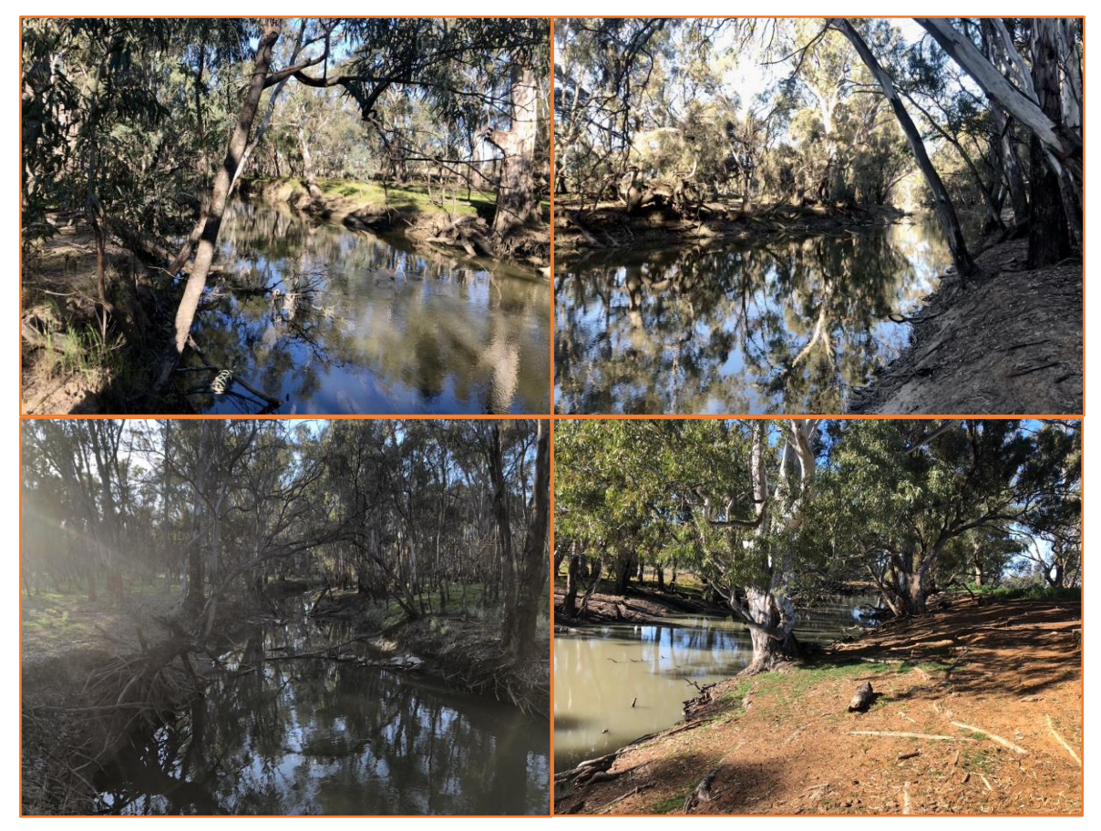
Figure 2. Four of the sights with the highest detection of Platypus DNA. Top left: Old Yanko Park, Top right and bottom left - two sights on Somerset park - Somerset Park 1 and Spiller's weir. Bottom right, the sandhill banks at Gorree would provide excellent digging conditions for nesting compared to the heavy clay-based soils that dominate the lower system. All sights have good shallow flow velocities, complex riparian and instream habitat structure, adjacent floodplain systems, high banks with loamy/sandy sections and comparatively clear water for the system.