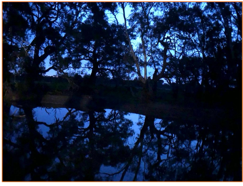
Picture 3. Evening falls on the high banks of the Yanco creek at Somerset Park, peak time for platypus foraging – Platypus eDNA was detected here at the time this picture was taken.

Figure 2. Four of the sights with the highest detection of Platypus DNA. Top left: Old Yanko Park, Top right and bottom left - two sights on Somerset park - Somerset Park 1 and Spiller's weir. Bottom right, the sandhill banks at Gorree would provide excellent digging conditions for nesting compared to the heavy clay-based soils that dominate the lower system. All sights have good shallow flow velocities, complex riparian and instream habitat structure, adjacent floodplain systems, high banks with loamy/sandy sections and comparatively clear water for the system.