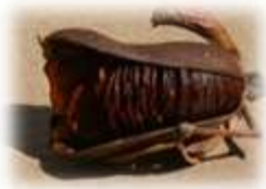
Native Frangipanni Pod

They planted over 50,000 trees, fenced off 80 kilometres of creek and 160 hectares of rainforest and provided 70 cattle troughs on properties! Their vision of a network of wildlife corridors across the farming landscape connecting the two national parks has become a reality.