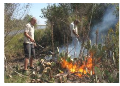
Pear burners in USA