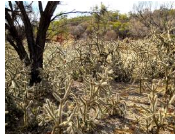
Snake cactus Qld.

Today, there is a new cactus-plague brewing. Although it primarily affects thinly-populated range lands, it has spread across the Wheat-belt and Goldfield regions of Western Australia, to the Flinders Ranges of South Australia, the Wimmera of Victoria State, and the lower Darling Basin and Lightning Ridge areas of New South Wales. In certain localities in outback Queensland, impressively large stands of invasive hybrid cacti have created impenetrable spiny barriers that exclude all stock animals and are choking out much of the other plant life. Cont'd. on page 3