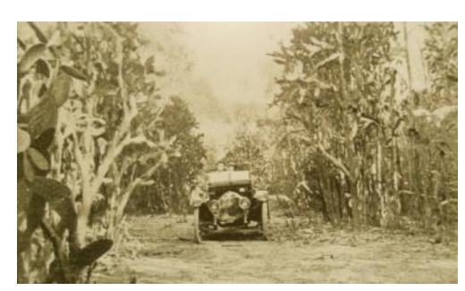
Car surrounded by tree pear in Qld. (early 1900's)