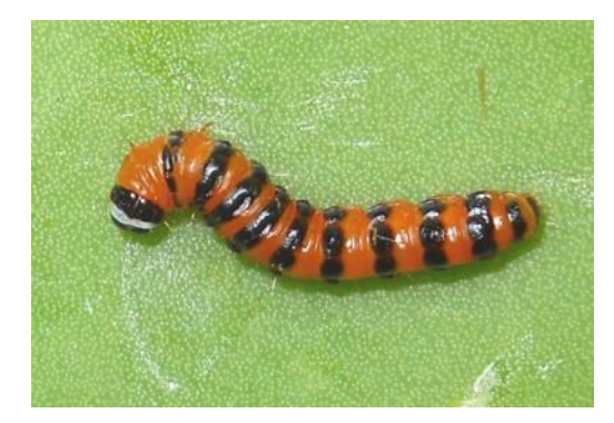
Catoblastis cactorum